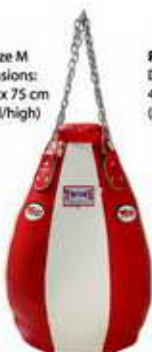
PPL Size M Dimensions: 60 cm x 75 cm (round/high)