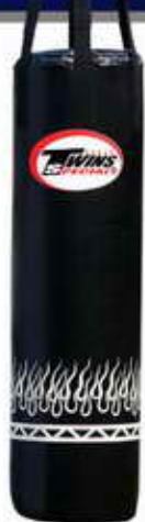
HBS Constructed of Heavy Duty tough synthetic leather with "Fire Flame" decoration Dimensions : 36 cm x 150 cm