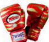
FBGV-2 G Red/Gold