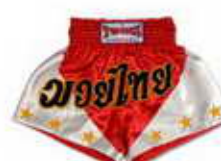
TBS-23 Triangle sides