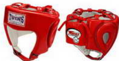
HGL-1 Safety and shock reducing foam for competition use, chin adjustable strap for superior comfort