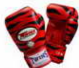
FBGV-2 B Red/Black

All Fancy Boxing Gloves are made of 100% cowskin leather ONLY with velcro strap and thumb attached (lace-up closure on special request) Colours : as shown on page 13 Sizes : 8 • 10 • 12 • 14 • 16 oz.