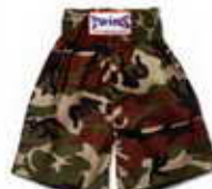
BTS-10 Army brown (cotton)

International sizes in inches. All trunks are made of nylon or satin (any design on special request)