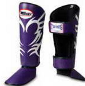
FSG-9 TATTOO PATTERN