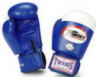
BGVL-1 Competition Boxing Gloves, velcro wrist strap