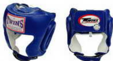
HGL-2 Great for training in the gym, velcro adjustable at the back for easy on and off