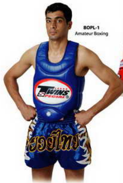
BOPL-1 Amateur Boxing

Body Protector (BOP), made of 100% cowskin leather or synthetic leather, with velcro closure at the back for training on punches, hooks, front kicks, foot jabs and knee strikes at the front and sides. Colours : Black • Blue • Red Sizes : M • L • XL.