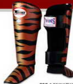
FSG-1 PAVAK TWINS PATTERN

All Fancy Shin Guards are made of 100% cowskin leather ONLY Colours/patterns as shown on pages 12 - 19 (Fancy Boxing Gloves) Sizes : S • M • L • XL