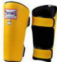
SGL-4 Heavy duty foam padding, velcro strap adjustment for a snug.