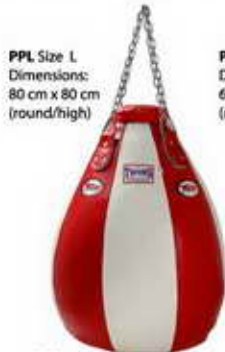
PPL Size L Dimensions: 80 cm x 80 cm (round/high)