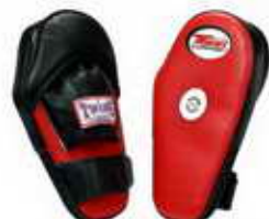
PML-8 Safety cushion on the back with velcro closure for good support.