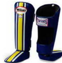
FSG-3 LUMPINEE PATTERN