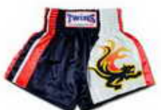
TBS-29 Firetail tiger