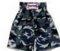
BTS-11 Army grey (cotton)