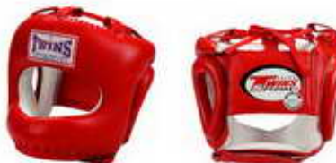
HGL-10 Enclosed face, steel nose & Chin protection.