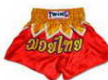
TBS-24 Zigzag waistband