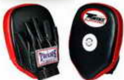
PML-3 Velcro closure, keep mitts secure to the hands, finger edges cut off for extra ventilation.