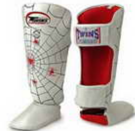
FSG-8 SPIDER PATTERN