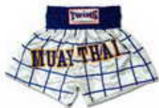
TBS-26 Muay Thai crossing lines