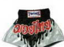
TBS-16 Silverflame two legs