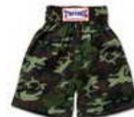
BTS-11 Army green (cotton)