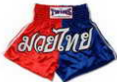
TBS-08 Duo colours long