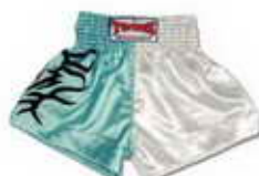
TBS-30 Duo colour long with tattoo