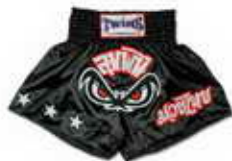
TBS-02 No Fear/Lumpinee