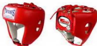
HGL-8 Professional used in style of Velcro under the chin & back, on the top lace up.