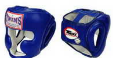
HGL-6 Elastic straps on top for comfortable fit