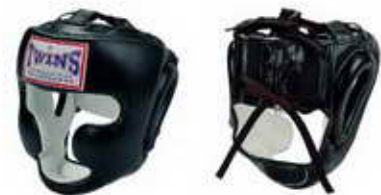
HGL-5 Chin & cheek protection for full contact sparring, lace up closure at the back for a perfect adjustment