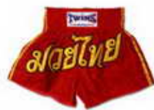
TBS-21 Plain two lines borders