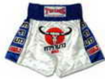
TBS-27 Carabao daeng