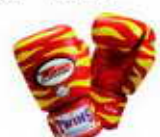
FBGV-2 Y Red/Yellow