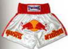
TBS-05 Red Bull