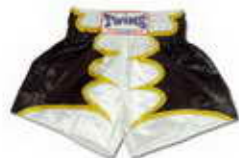
TBS-25 Sleeping bat