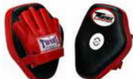
PML-4 Built for extra fast training movements due to lightweight construction for extra long use