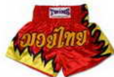
TBS-09 Mixed borders