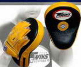
PML-1 Standard punching mitts, all leather construction with buckle closure (closed fingers)