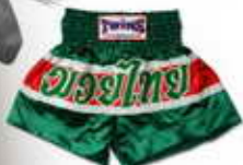
TBS-03 Tripple lanes wide / borders