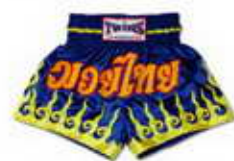
TBS-06 Pikes attack