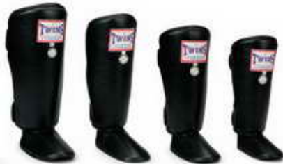
Sizes : XL L M S