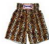
BTS-08 Leopard pattern