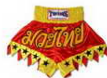
TBS-11 Cut legs with stars