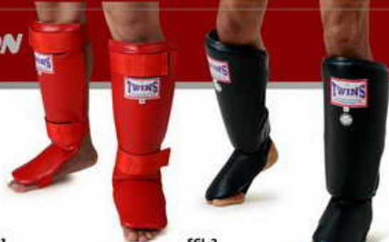
SGS-1 Made from strong synthetic leather.