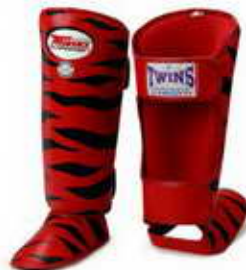
FSG-2 TIGER PATTERN

All Fancy Shin Guards are made of 100% cowskin leather ONLY Colours/patterns as shown on pages 12 - 19 (Fancy Boxing Gloves) Sizes : S • M • L • XL