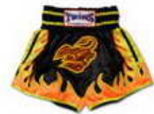
TBS-12 Scorpion on fire