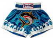
TBS-17 Shark oceanwaves