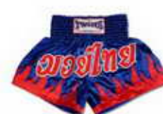
TBS-22 Muay Thai under attack