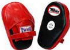
PML-5 Design for extra stability and safety, ready for serious pounding with absorbing padding covered fingers and hand area for extra security