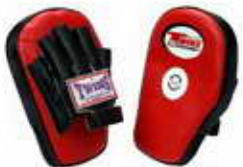
PML-6 Open fingers have been designed for good ventilation, velcro closure on back to eliminate slipping