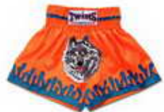
TBS-28 Wolf in the forest