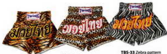
TBS-31 Tiger pattern