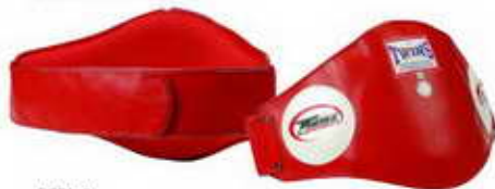
BEPL-2 Belly Protector with velcro closure (leather)