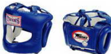
HGL-9 Steel frame built inside all over around the face also nose protected, open chin.