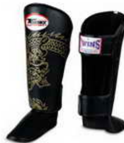
FSG-6 DRAGON PATTERN