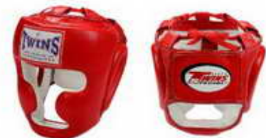
HGL-3 Chin & cheek protection for full contact sparring also provides increased face coverage