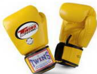
BGVL-3 Boxing Gloves, velcro wrist strap for full security, ideal for quick wear and take off