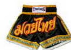
TBS-18 Shiny ribbon with tassle