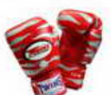
FBGV-2 S Red/Silver