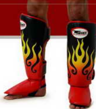
FSG-7 FIRE FLAME PATTERN