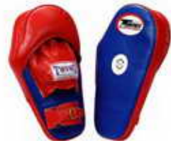
PML-7 Safety cushion on the back for a great elbow & hand workout, with buckle closure for good support