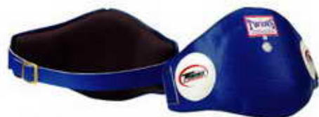
BEPS-1 Belly Protector with classic buckle waist wrap (synthetic leather)