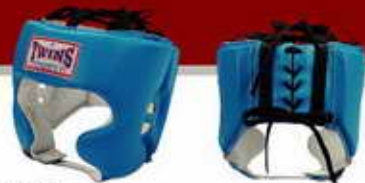
HGL-7 In this model is the professional use for those who are really serious about their training and sparring session.