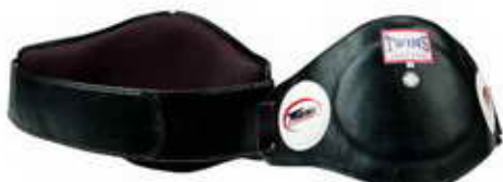
BEPS-2 Belly Protector with velcro closure (synthetic leather)

Belly Protector (BEP), made of 100% buffalo-skin leather or synthetic leather, with classic buckle waist wrap or velcro closure at the back for training on front kicks, foot jabs and knee strikes. Colours : Black • Blue • Red. Sizes : M • L • XL.