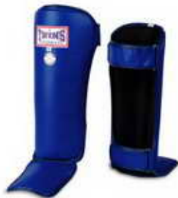
SGL-3 Light weight and slim design, full leather, full shin in-step. Suitable for Tournament use.