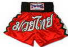
TBS-10 Zigzag borders