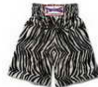
BTS-07 Zebra pattern