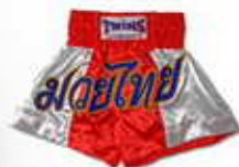
TBS-01 Tripple lanes long