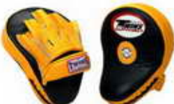
PML-10 New creation Focus Mitts in curved style.