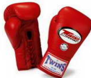
BGLL-1 Boxing Gloves lace up closure