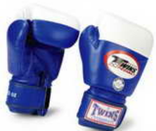
BGVL-2 Boxing Gloves for Amateur International Boxing