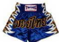
TBS-13 Sharp teeth borders