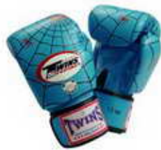
FBGV-8 Light blue