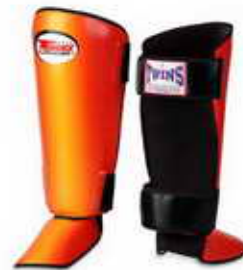
FSG-4 COLOUR SLIDE PATTERN