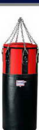
HBNL Size L Dimensions : 40 cm x 100 cm