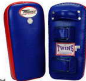
KPL-2 Kicking Pad with velcro arm lock and top holder for quick fit in and release