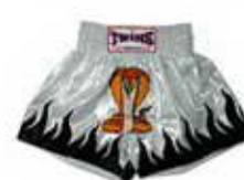
TBS-19 Cobra under attack