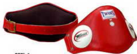
BEPL-1 Belly Protector with classic buckle waist wrap (leather)