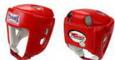
HGL-4 Extra head padded for Muay Thai training, added protection against elbow and axe kick at the top of the head