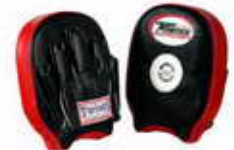
PML-11 Small Apple-Shaped Focus Mitts for more training on more punching accuracy