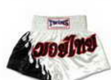
TBS-15 Flame right leg