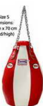
PPL Size S Dimensions: 44 cm x 70 cm (round/high)