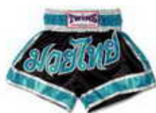
TBS-04 Ribbons & borders