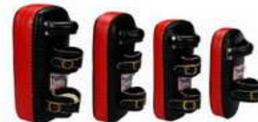
Sizes / Dimensions (wide-long-thick / cm)