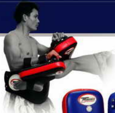
KPL-1 Kicking Pad with buckle arm lock and top holder (designed and used for Muay Thai training)