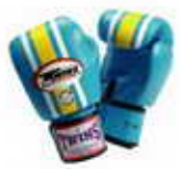
FBGV-3 Light blue