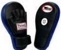
PML-9 Deluxe Punching Mitts with open fingers for good ventilation, with velcro arms lock