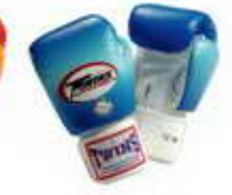
FBGV-5 Light blue