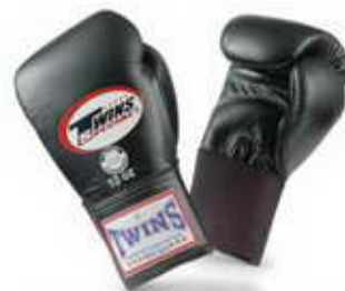
BGEL-1 Boxing Gloves elastic wrist closure