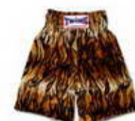
BTS-09 Tiger pattern