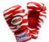
FBGV-2 W Red/White