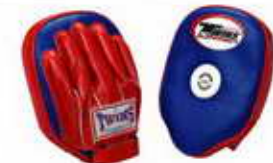
PML-2 Velcro closure around the wrist keep mitts secure to the hands (closed fingers)