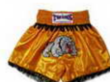
TBS-20 Bulldog with tassle