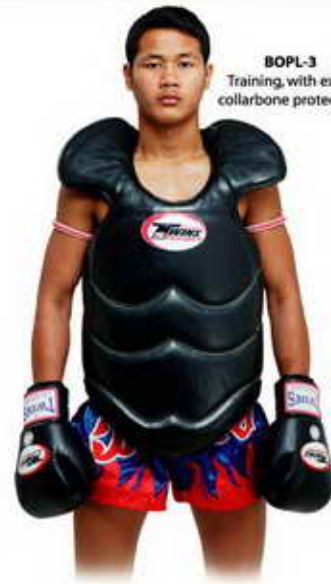
BOPL-3 Training, with extra collarbone protection