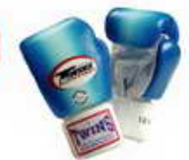
FBGV-4 Light blue