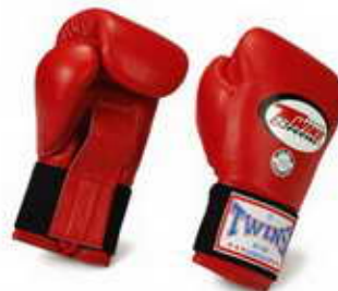
BGLEL-1 Boxing Gloves, lace up with elastic wrist closure

All Boxing Gloves (BG) are made of 100% cowskin leather (synthetic leather on special request). The 6, 8 and 10 oz. professional fight gloves for earlier Muay Thai or International bouts. The 12, 14 and 16 oz. are ideal for training. The extra weight is great for a better work-out. Extra handpadding for the use of heavy bags or training with sparring partner.