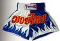
TBS-07 Duo colours long with flame